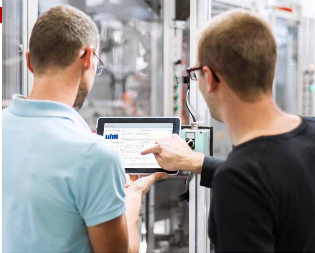
Increasing quality, output and availability: Efficient manufacturing and optimized processes by means of the analysis software Analysis-CI of STIWA Manufacturing Software

STIWA is one of the world's leading specialists in the field of high-performance automation. The three strategic business areas are Automation, Automotive Supplier Production, and Software. The family-owned enterprise headquartered in Attnang-Puchheim employs more than 2,200 members of staff in four countries and achieved a turnover of 260 million euros in the financial year 2019/2020.